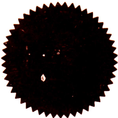
Commissioner of Patents Commissaire des brevets

EN FOI DE QUOI j'ai signe les presentes et y ai fait apposer le sceau du Bureau des brevets a Hull, Quebec, le